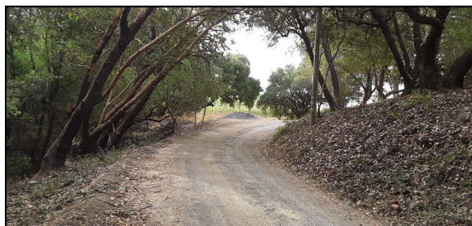
AFTER PHOTO—GEYSERVILLE ROADSIDE CLEARANCE

Geyserville Roadside Clearance : Reduction of the horizontal continuity and vertical arrangement of vegetation up to 30 feet along both sides of 42 miles of the following designated roads: The Vineyard Club roads, Fox Ridge Road, Pocket Ranch Road, Ridge Oaks Road, Coyote Ridge Road, Rossi Road, Breezewood Road, Rossi Road, Tzabaco Creek Road, O'Brien Road, Maacama Ridge Road, Brack Road, Big Ridge Road, Chemise Road, Shania Way, Koch Road, Mountain View Ranch Road, and Bradford Mountain Road. The completion date is January 1, 2022.