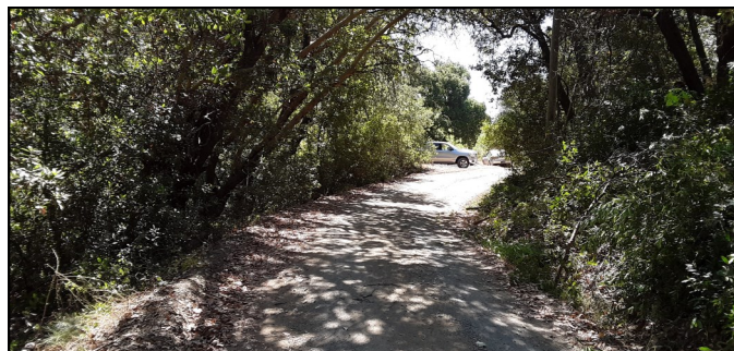
BEFORE PHOTO—GEYSERVILLE ROADSIDE CLEARANCE

The District has been awarded two grants from CAL FIRE's Climate Investments Fire Prevention Grant Program. The two grants provide for chipper staffing to perform fuel modification and reduction along roads to reduce ignitions, fire intensity, and to provide for evacuations and emergency vehicle access during a wildland fire. The two grants are described below and we hope these projects will build momentum towards a permanent fuel reduction program and additional grant funded work.