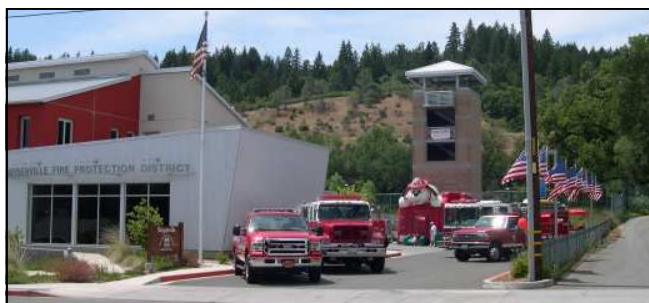
A view of the Firehouse from the 2009 Open House

learn more about the Geyserville Fire Department, including what it does and how it still depends on volunteers to protect the community. We look forward to seeing you there!