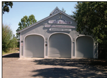
Volunteers needed in Alexander Valley to serve Station No. 2

Although the Geyserville Fire Protection District is no longer an all-volunteer fire department, volunteers are still a vital part of the program, and new volunteers are needed now as much as ever. The Department's paid staff consists of four full-time firefighters and one part-time fire chief, along with the recent addition of volunteers working paid stipend shifts. Our small paid staff is not enough to effectively cover over 200 square miles of area and run equipment from