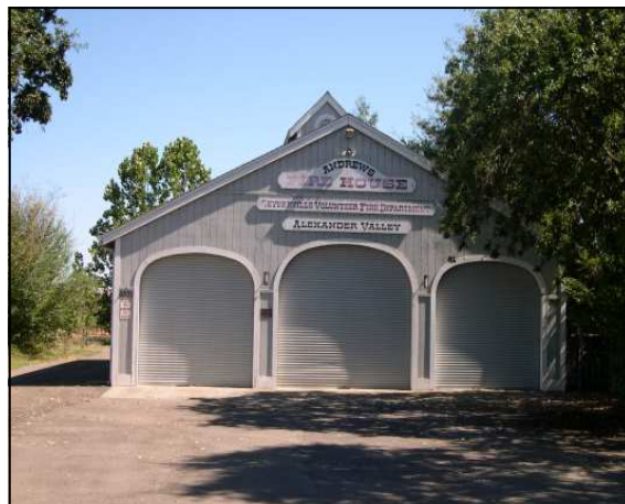
Volunteers Needed at Station 2 (Pictured Above)

help us prevent higher taxes and fire insurance premiums. Become a Volunteer Firefighter Today!